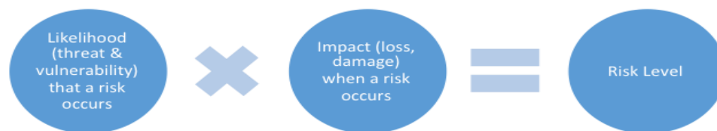
Fig. 5 Risk Analysis (Likelihood & Impact)

19.3.3 The level of risk can be mitigated by reducing the size of the threats, vulnerabilities, or their impact. Please refer to section 11 above which highlights some of the vulnerabilities of the accountants, in addition to FATF Guidance, number 2 under References at Appendix F . It should be noted that this is not an exhaustive list. Every segment of the business operations where ML/TF threats and vulnerabilities to those threats may emerge must be analysed continuously to determine the exposure to ML/TF and to ensure that same is properly managed.