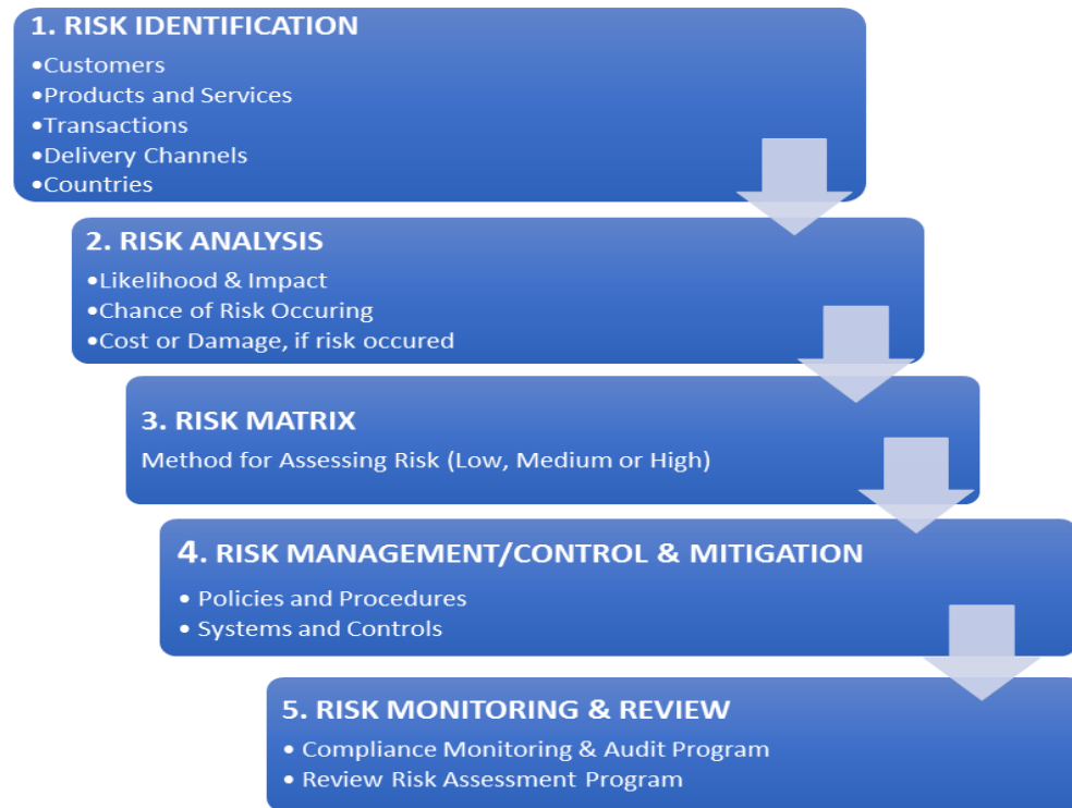
Fig. 4 - OVERVIEW OF FIVE (5) STAGES OF A ML/TF RISK ASSESSMENT PROCESS 10 :